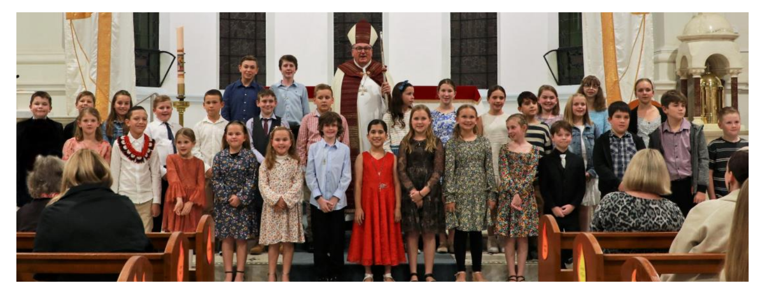
Thursday night's Confirmation group