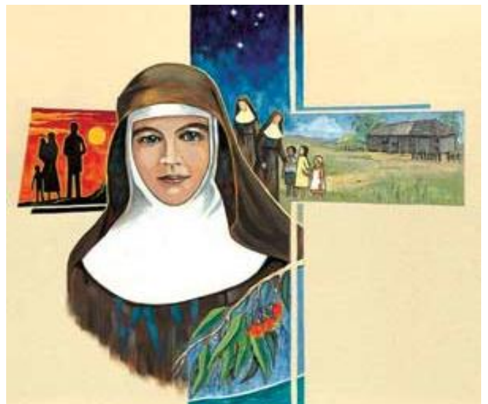
St Mary of the Cross