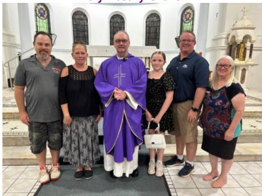
Holy Rosary Church