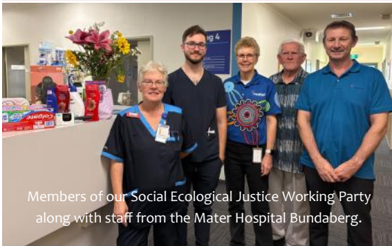
Members of our Social Ecological Justice Working Party along with staff from the Mater Hospital Bundaberg.