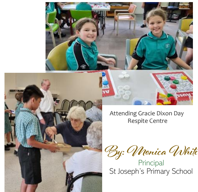
Serving Parishioners morning tea at the Anointing Mass

St Joseph's will continue to focus on providing a quality Catholic Education as we move towards Celebrating 150 years.