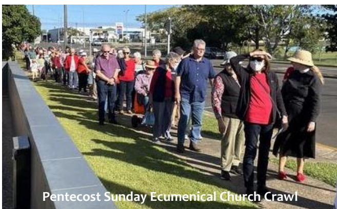
Pentecost Sunday Ecumenical Church Crawl