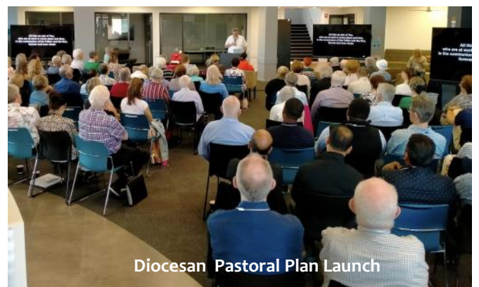
Diocesan Pastoral Plan Launch

The Catholic Parish of Bundaberg respectfully acknowledges the Taribelang Bunda, Gooreng Gooreng, Gurang, and Bailai Peoples as the Traditional Custodians of the country in which we live. We pay our respects to their Elders, past, present and emerging.