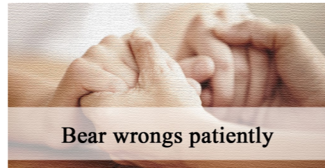
Bear wrongs patiently

7:00am St James' 8:00am Holy Rosary 9:00am St Mary's 5:30pm Holy Rosary