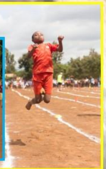
DAY 6 to 9: You are the COACH and 4 Primary Schools want to WIN !

"An incredible 20 day journey for people who love people with the best of Tanzania in between! This is a mighty cultural immersion journey" ... Bernie K