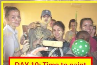
DAY 10: Time to paint those classrooms