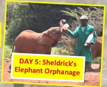
DAY 5: Sheldrick's Elephant Orphanage