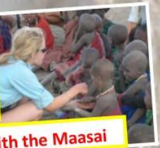
DAY 12 to 14: You are living with the Maasai