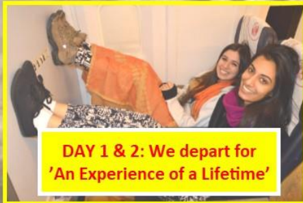
DAY 1 & 2: We depart for 'An Experience of a Lifetime'

DEPARTS BRIS OR SYD DEC 5, 2019 DEC 3, 2020