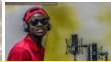
DAY 2 to 5: Sing, Dance, Embrace Kibera ... the great slum of Nairobi.