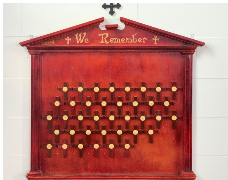
Memorial board at Holy Rosary Church

Our parish will be happy to arrange memorial services for you as soon as our churches are reopened with "unlimited" numbers. Just contact the Parish office (4151 6666) if you would like to organise a memorial service for your loved one, or would like to gather together with others to remember and to celebrate the life of deceased loved ones.