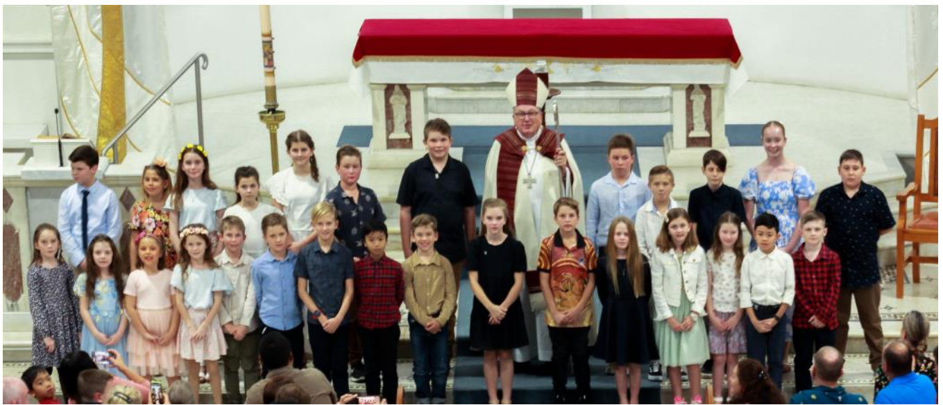
Tuesday night's Confirmation group

This week seventy children have been confirmed in our parish and have been sent on mission.